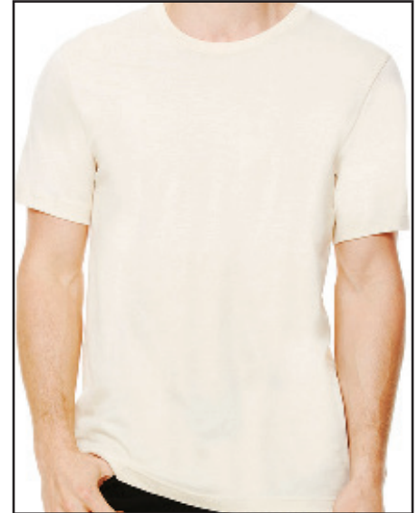
Unisex 100% Cotton t-shirt